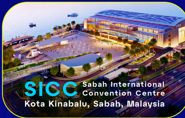
SICC Sabah International Convention Centre Kota Kinabalu, Sabah, Malaysia